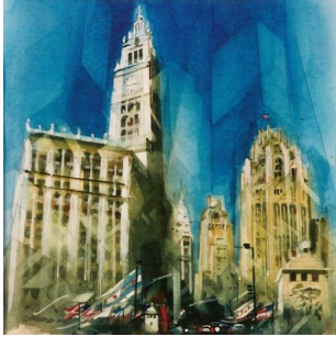
Chicago, Wrigley Building & The Tribune Tower