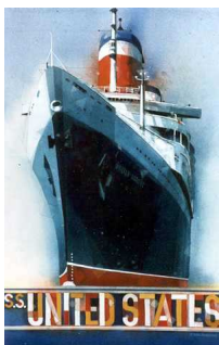
S. S. United States