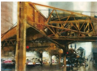
Chicago, Wabash Avenue, The L